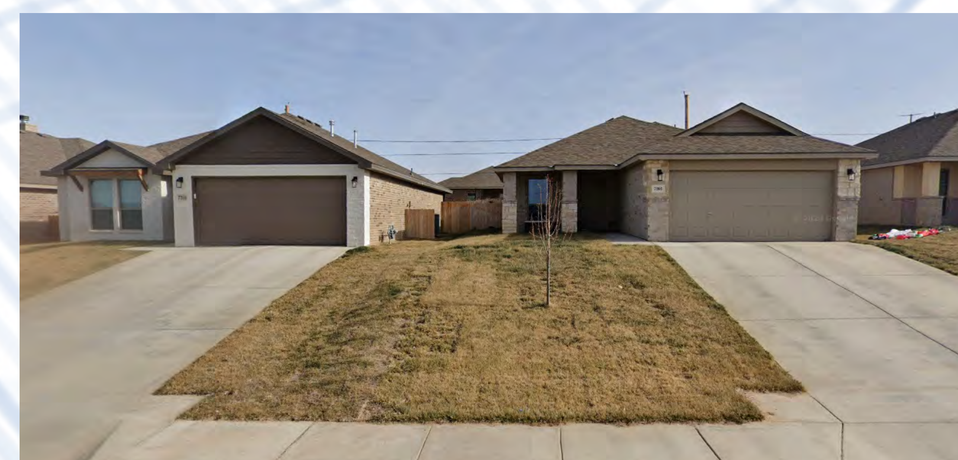
50ft Front Loaded