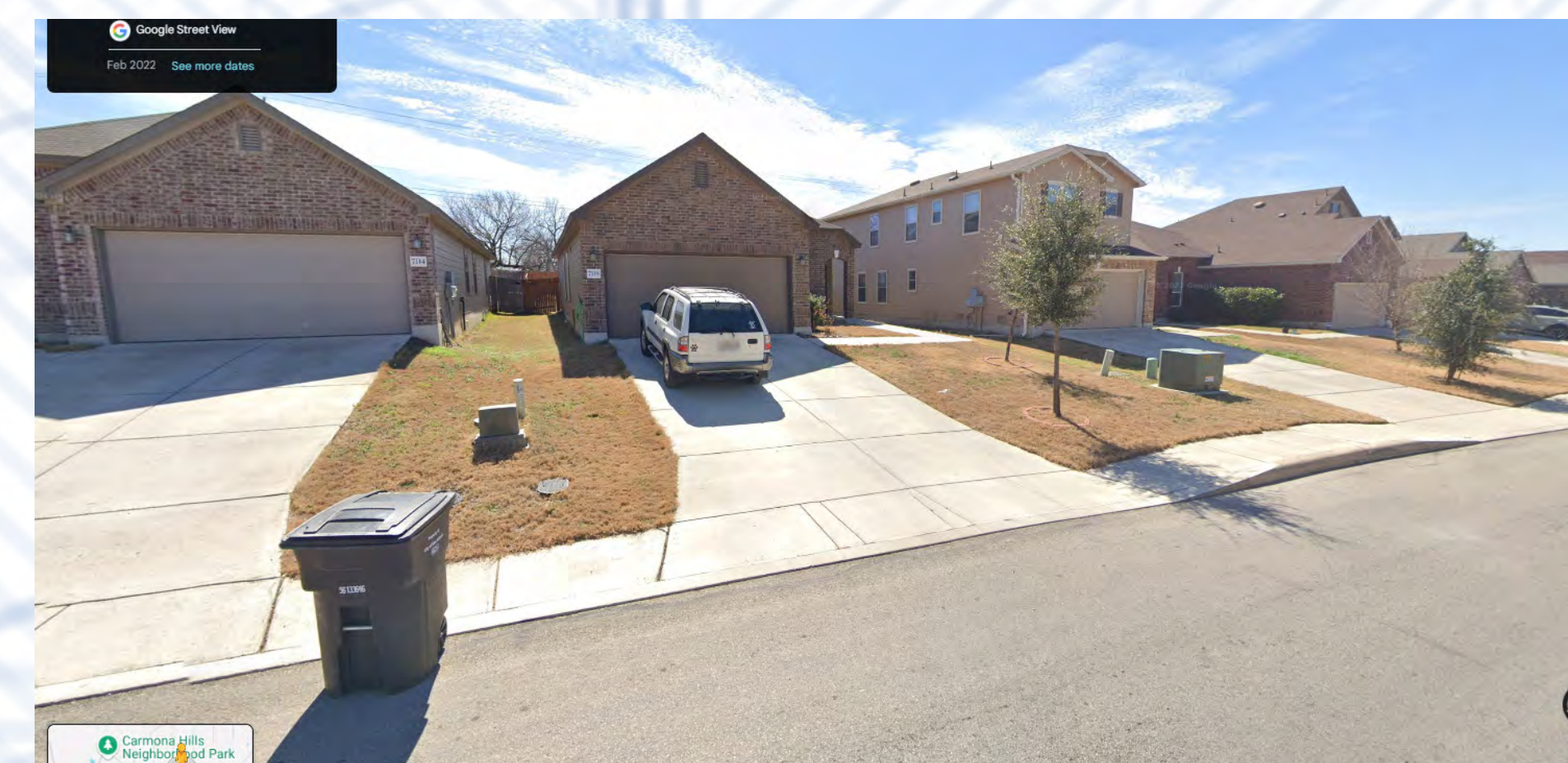
40ft Front Loaded