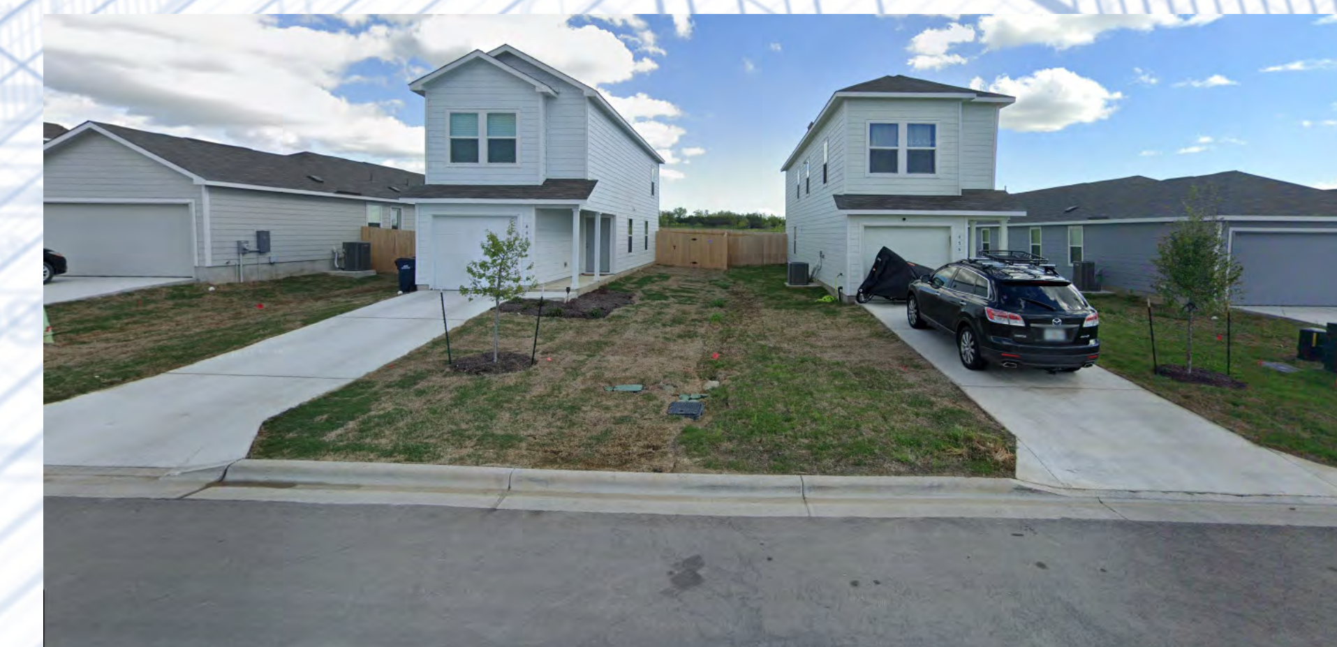
35ft House Type Front Loaded