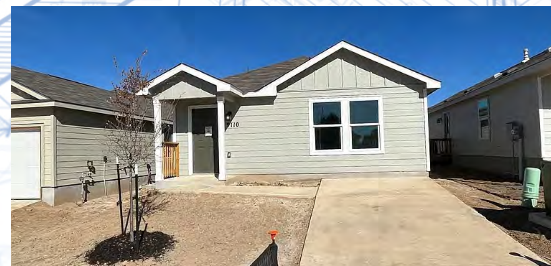
35ft Front Loaded