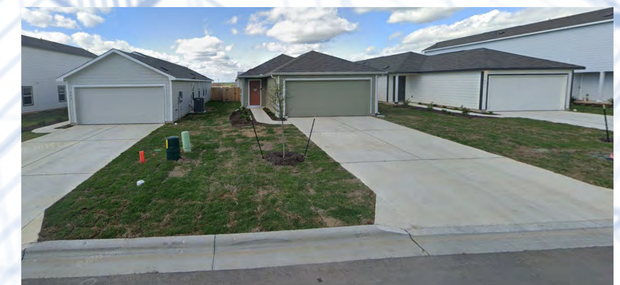
40ft Front Loaded