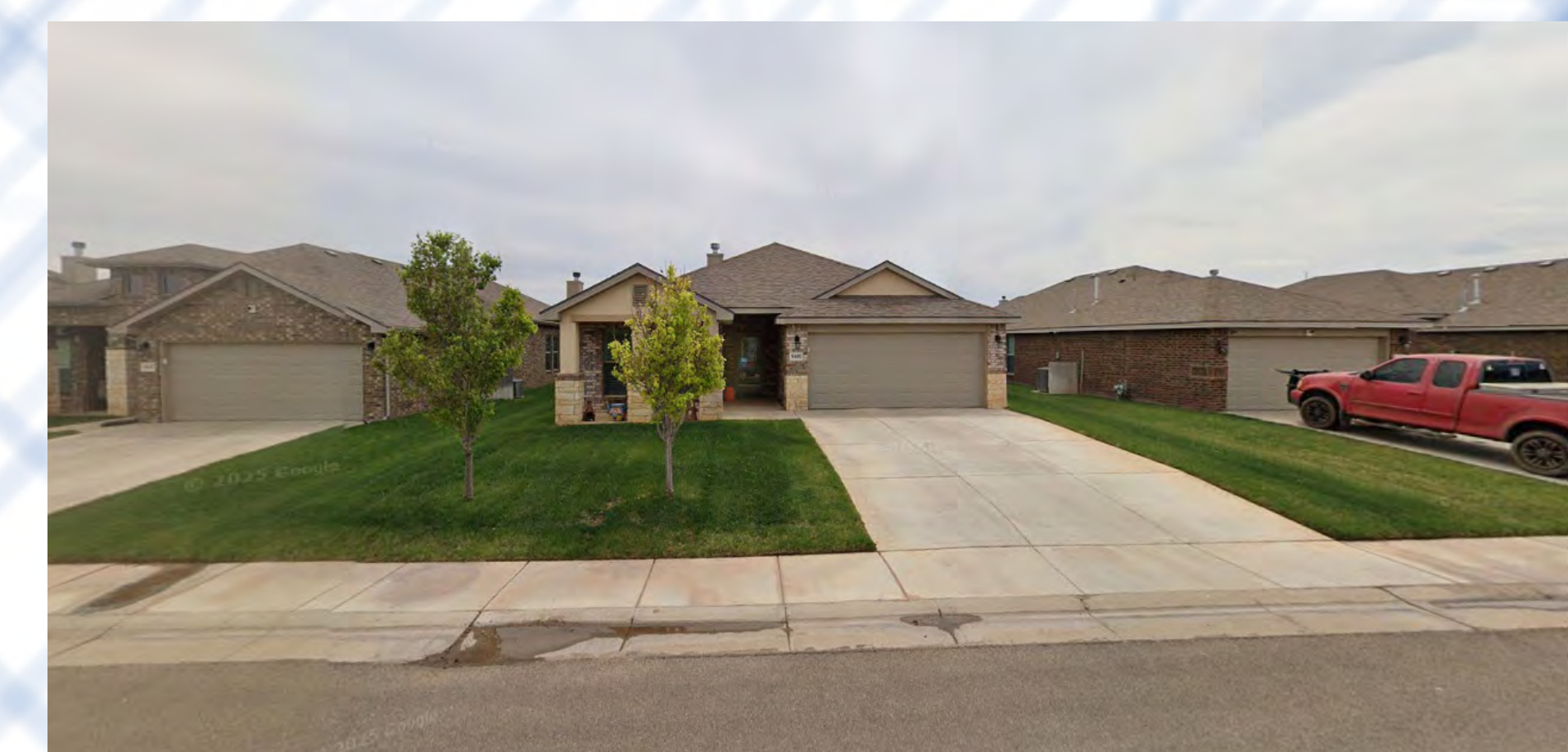
60ft Front Loaded