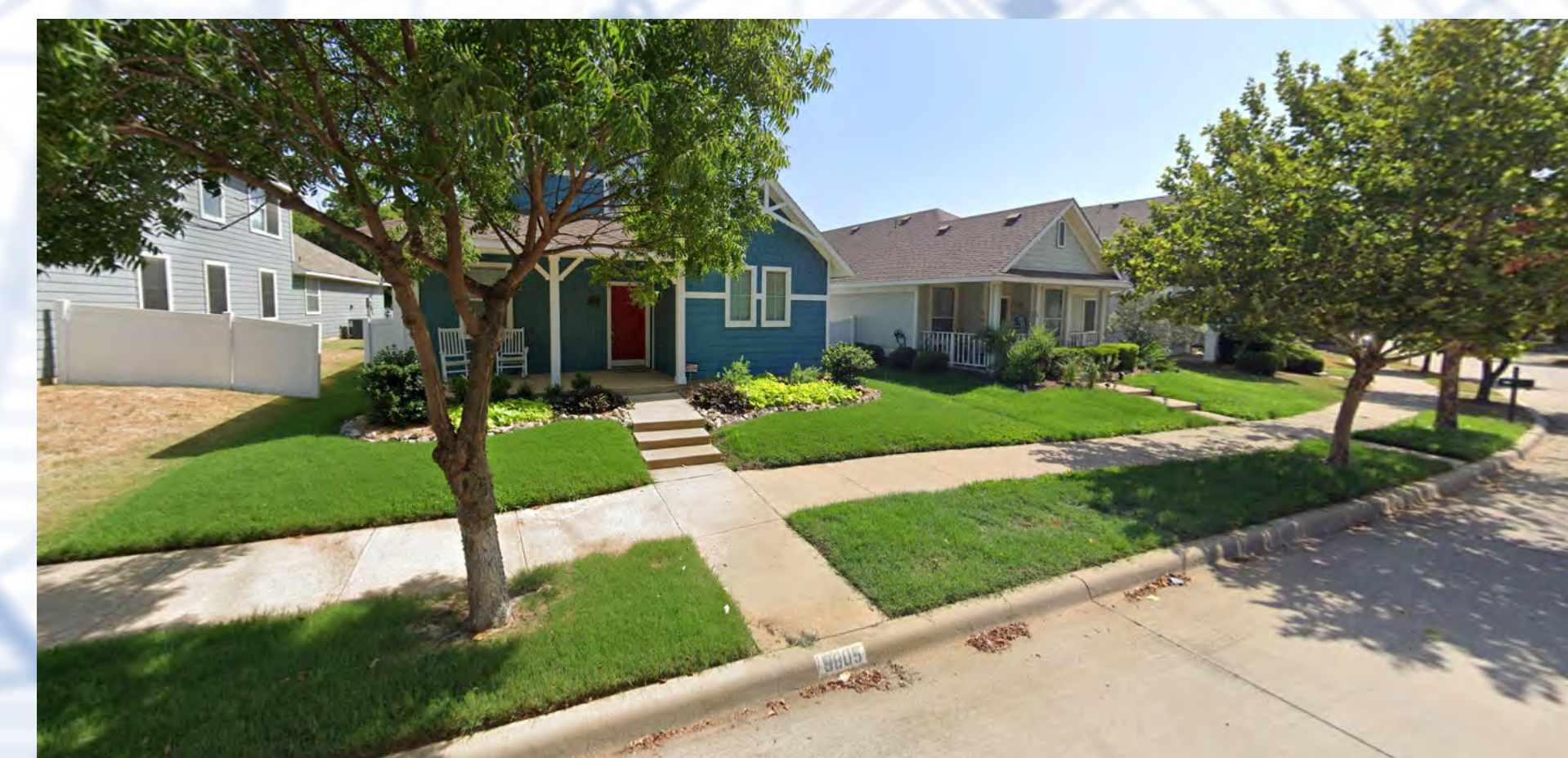
40ft Alley Loaded