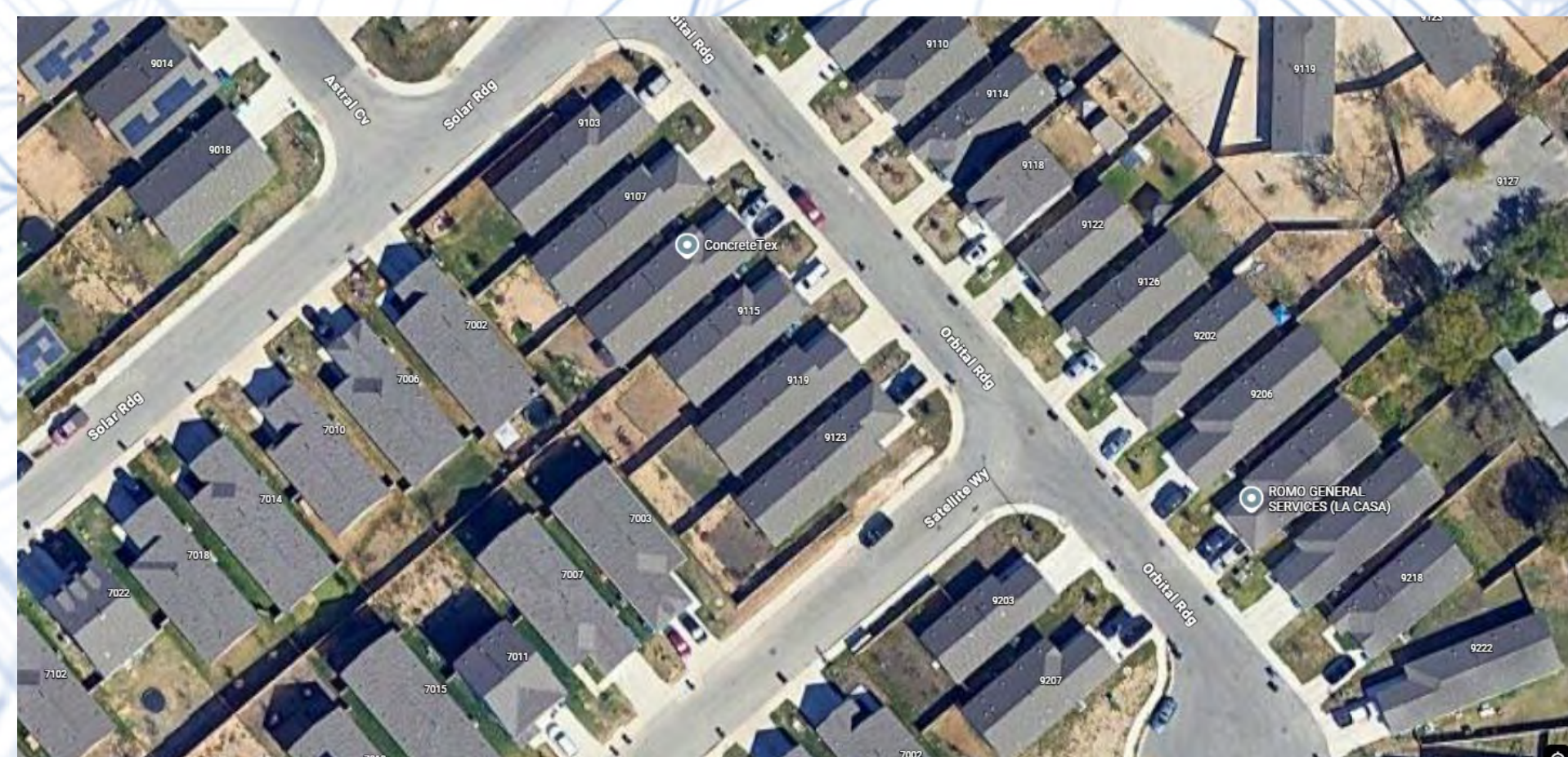
35ft Front Loaded Aerial

Lot Width Min: *Same as R-3*; SUP for smaller Lot Depth Min: *Same as R-3* Lot Area Min: *Same as R-3* Lot Coverage: *Same as R-3* Front Yard Setback: *Same as R-3* Rear Yard Setback: *Same as R-3* Interior Side Yard Setback: *Same as R-3* Side on Street Setback: *Same as R-3* Required Off-Street Parking: *Same as R-3*