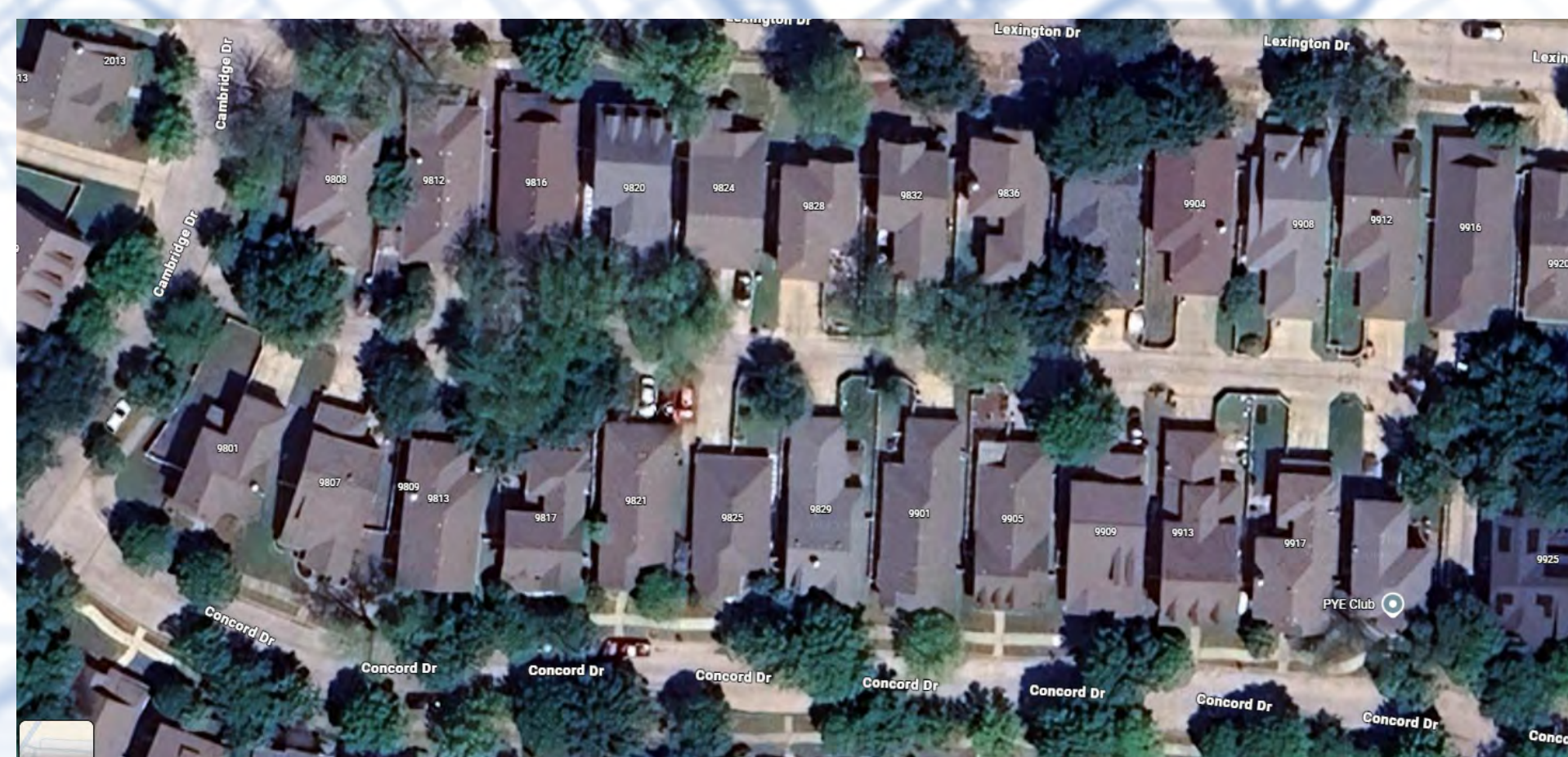
40ft Alley Loaded Aerial