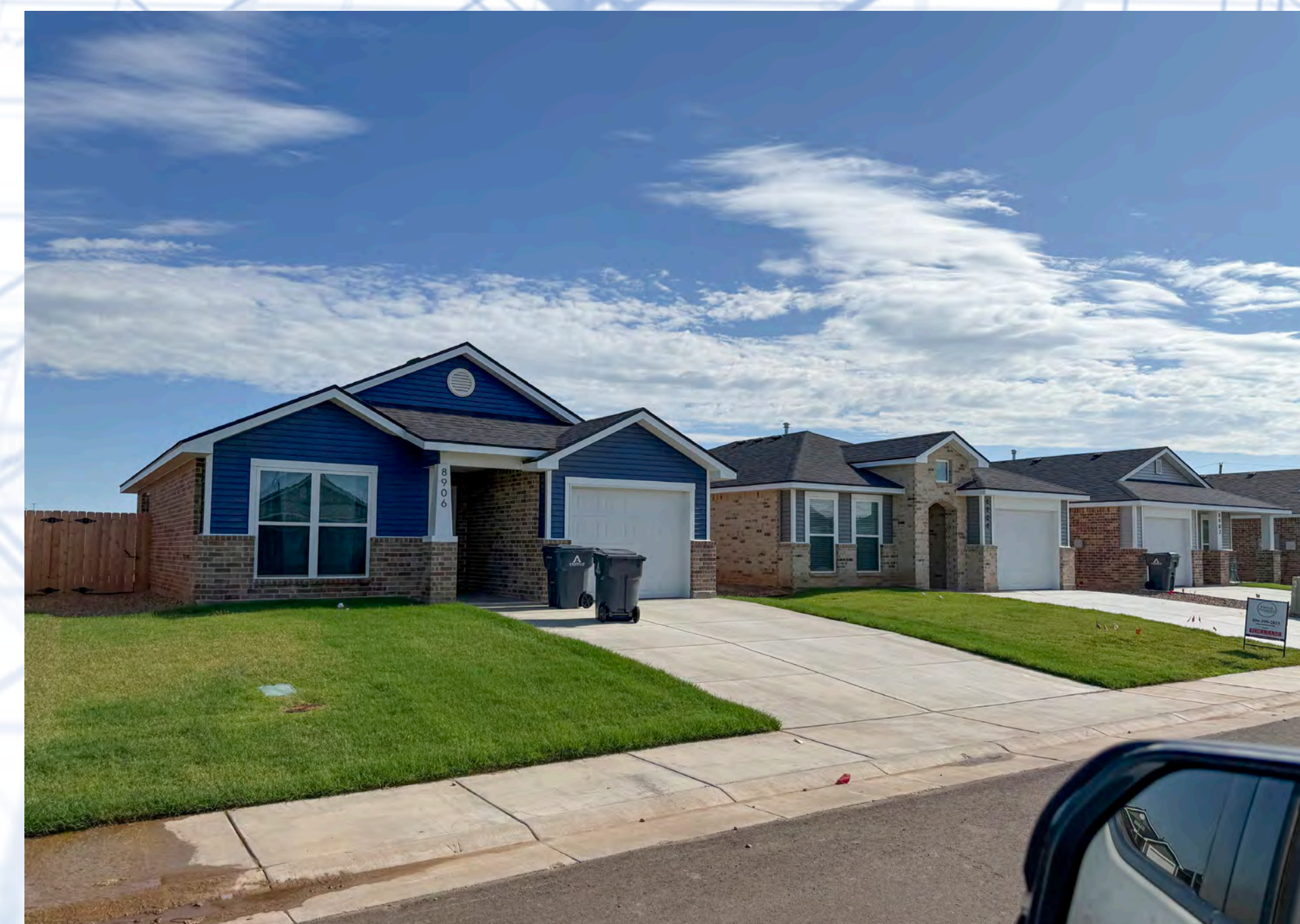
SF Detached 40ft Lot