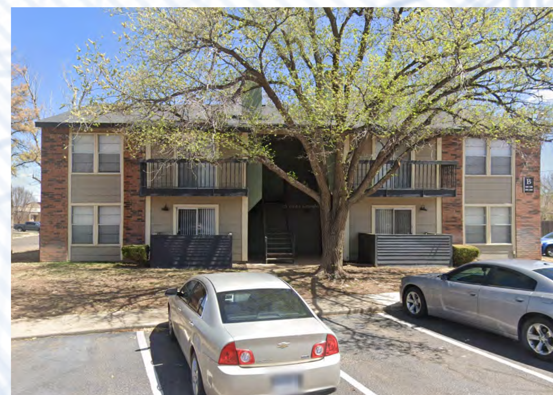
2-Story Apartments Quadplex