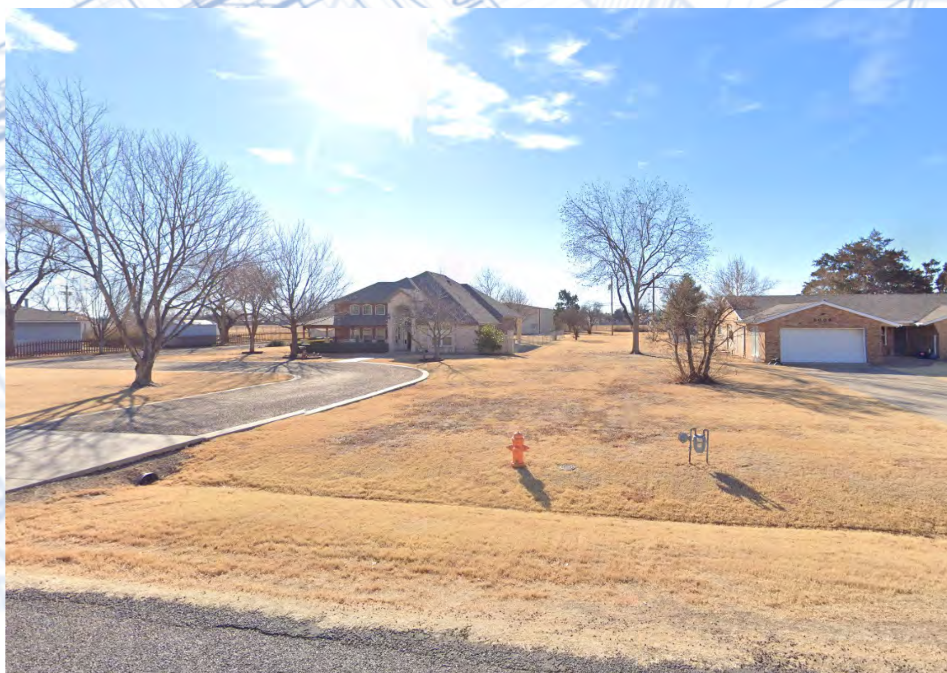
SF Detached Large Lots